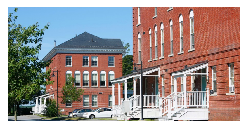
Brick Hill Affordable Housing Development District

The City of St. Louis currently allocates new taxes that result from the development project to a special fund. This fund is used for the sole purpose of reimbursing developers. Other cities have seen the inefficiency of using these funds just for reimbursement costs, opting to set aside portions of these returns to use for affordable housing. Here, a municipality reserves a percentage of revenues from the development to cover affordable housing costs in the TIF district or elsewhere.[35]