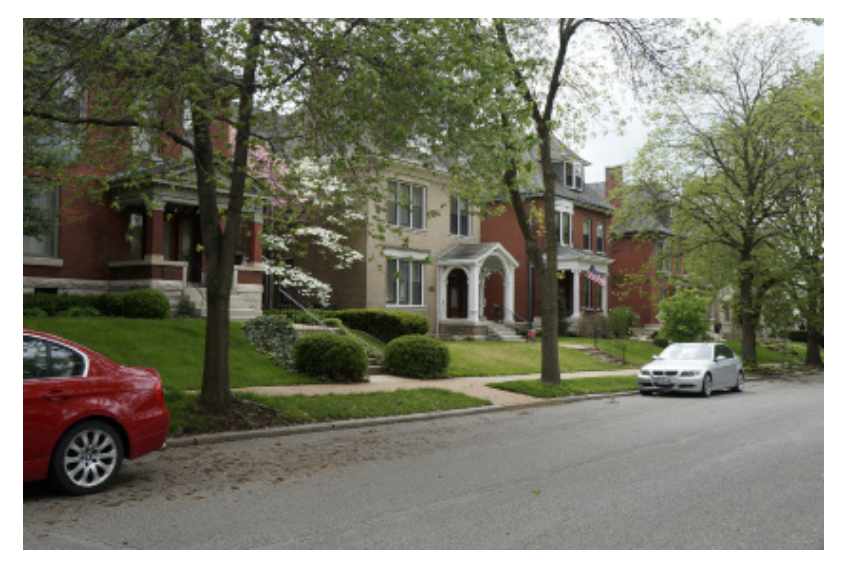
3670 Flora Place in the Shaw neighborhood

The way in which tax abatement has been granted and utilized within the catchment area has resulted in it becoming a mechanism of displacing lower-income people. Several residents mentioned the distribution of tax abatement as a problem, particularly in the Shaw neighborhood and the 8th Ward more broadly. While analyzing all instances of tax abatement being granted in the catchment area is beyond the scope of this project, we will highlight two examples in which "spot-blighting" was utilized as justification for granting tax abatement. The first, 3501 Juniata, is technically south of the City Garden catchment area but is within the same city ward as Shaw. This property was purchased in 2007 for $385,876.[24] Alderman Conway proposed Board Bill 201 to grant tax abatement for new construction, and a 10-year abatement was granted.[25] Since then, taxes on the property have ranged from $205 in 2009 to $230 in 2014 annually.[26] The second example does fall directly within the catchment area, in the Shaw neighborhood (also in the Eighth Ward). Board Bill 30 gave 3670 Flora Place a five-year abatement because it was "in bad shape," according to Alderman Conway when he presented the bill.[27] The property was purchased for $380,000 in 2013[28]; since abatement was granted, hundreds of thousands of dollars' worth of improvements have been made to the property.