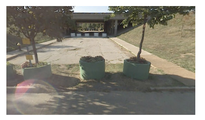
An example of a blocked roadway under Highway 44 that separates the Shaw and Botanical Heights neighborhoods.