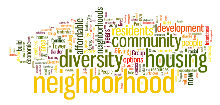
This word cloud is drawn from the ideas and participation of over 60 participants in a community meeting about sustaining the social and economic diversity of the City Garden catchment area neighborhoods held in February 2015.

With the continued growth of capital projects and housing development in the City of St. Louis, important conversations about the potential consequences of neighborhood change are taking place. The findings of this report are designed to advance these ongoing conversations into formal approaches and opportunities to advocate for affordable housing and inclusive development.