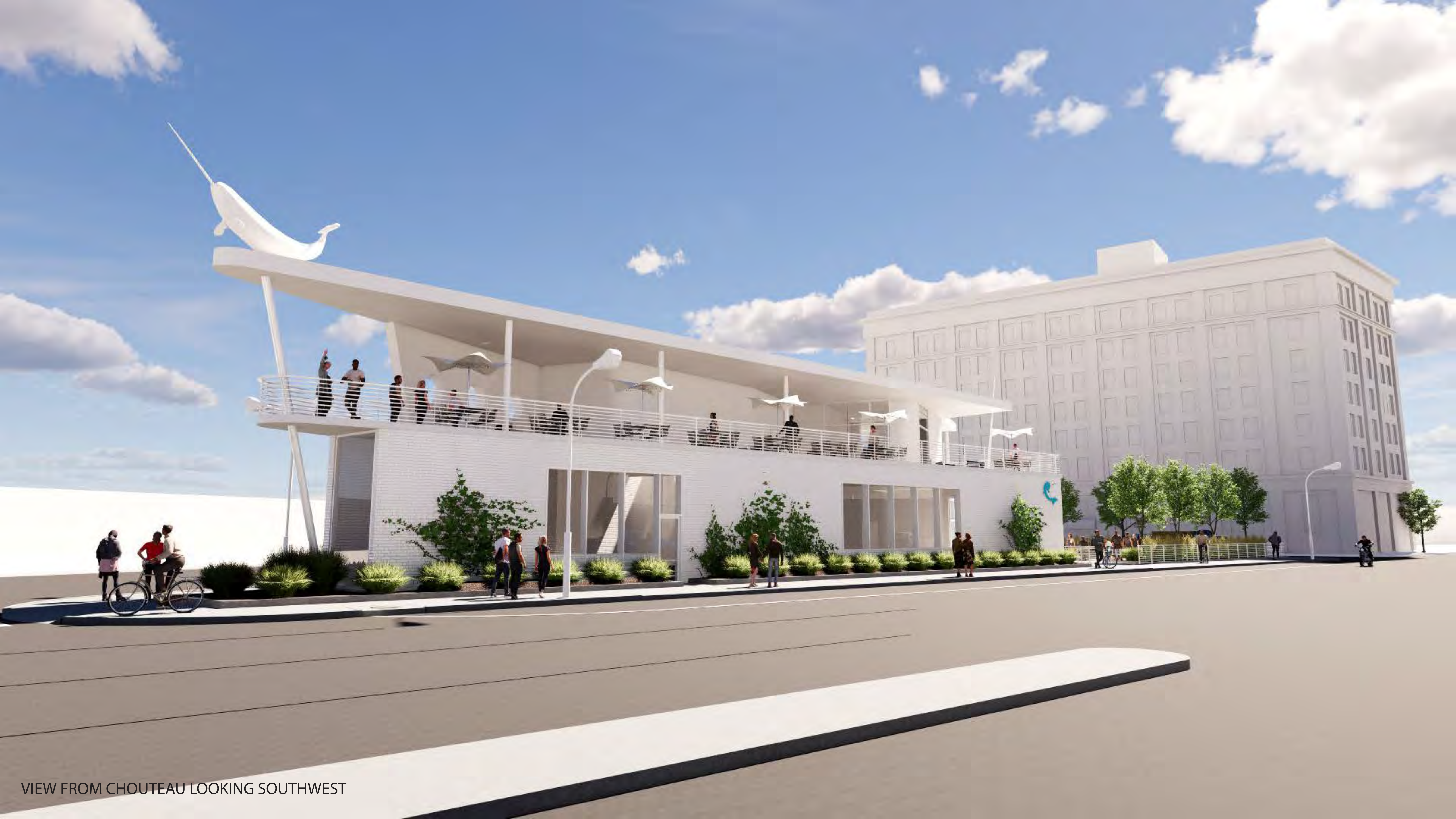
VIEW FROM CHOUTEAU LOOKING SOUTHWEST