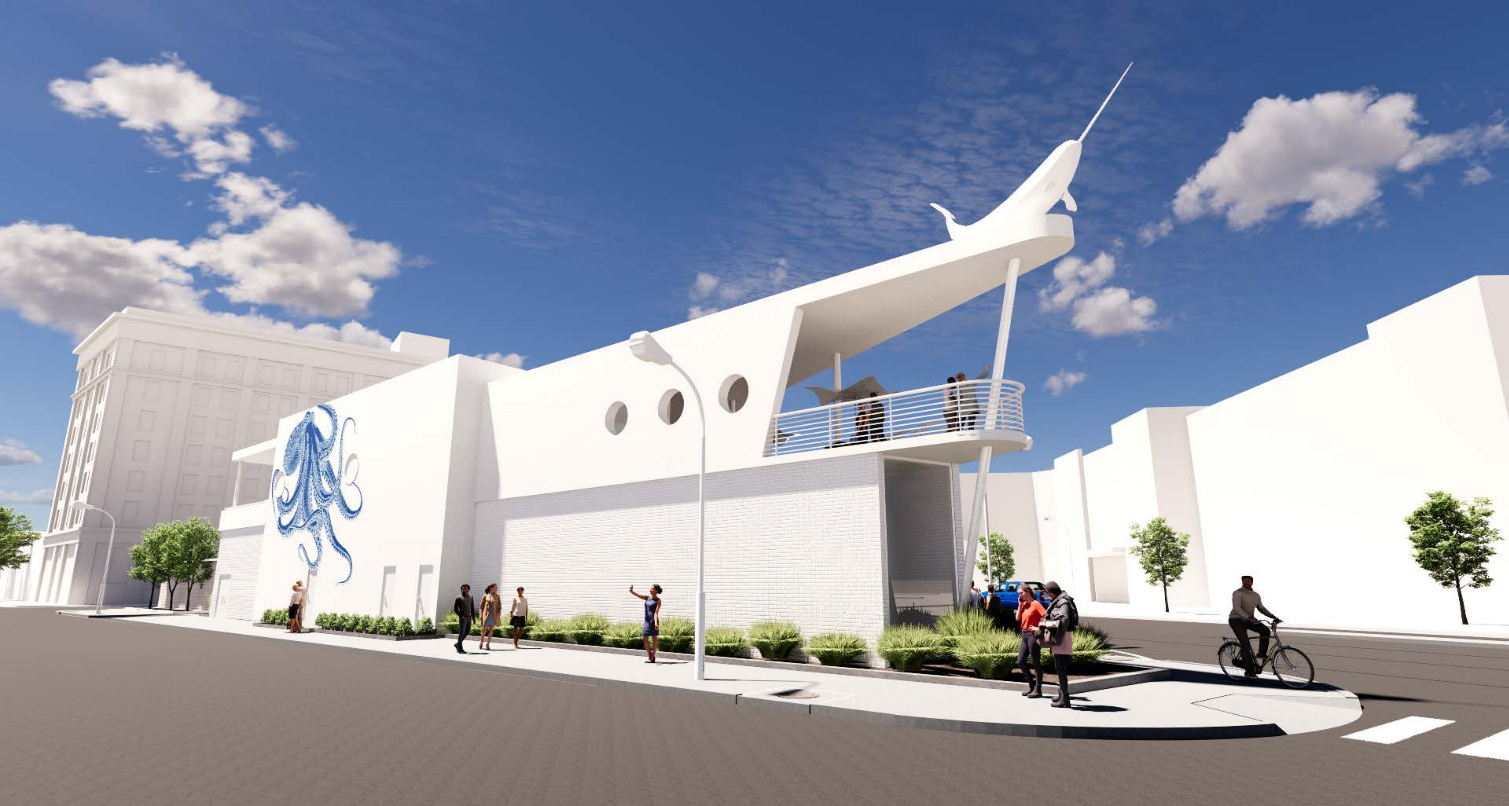
VIEW FROM VANDEVENTER LOOKING WEST