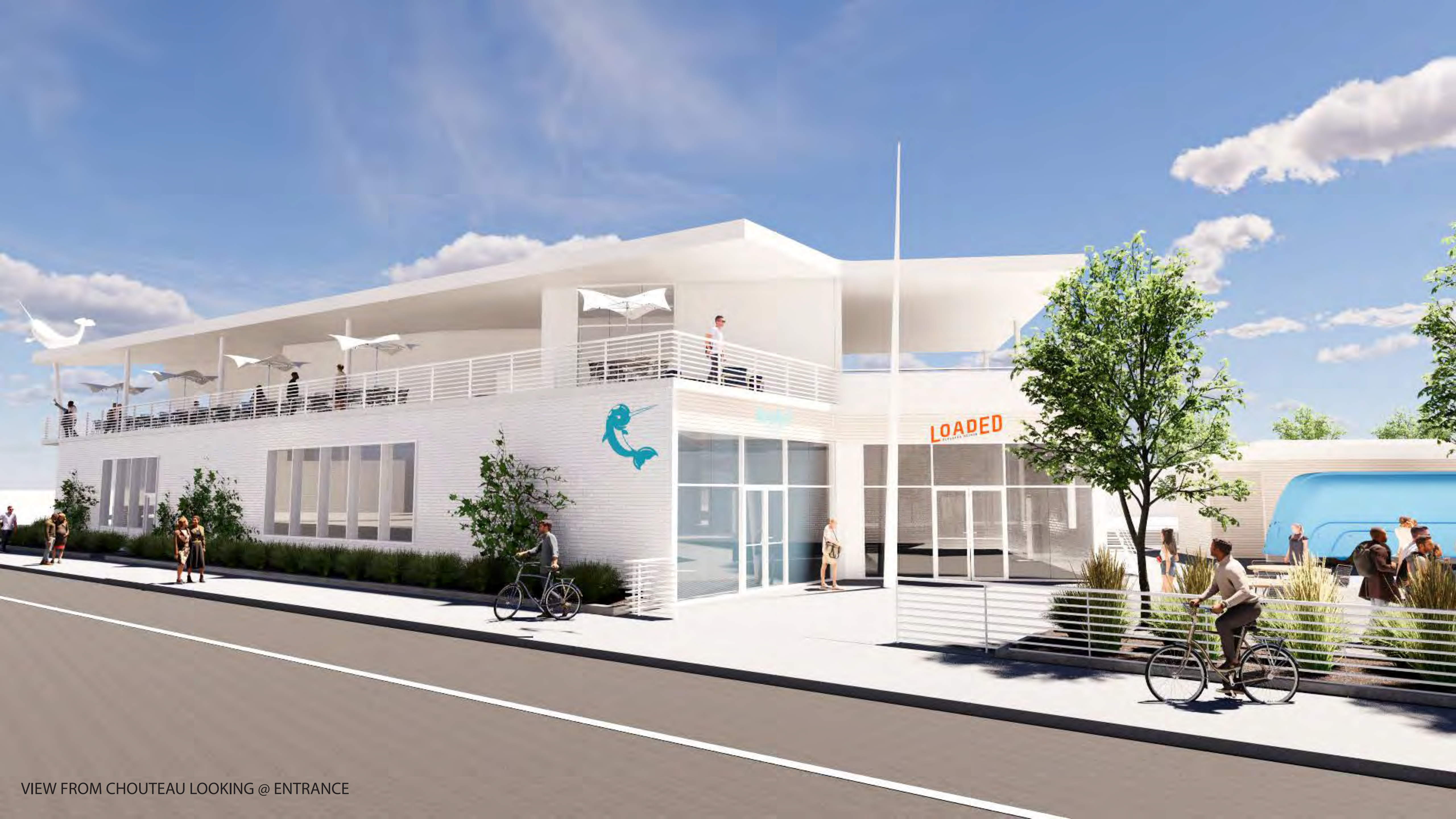
VIEW FROM CHOUTEAU LOOKING @ ENTRANCE