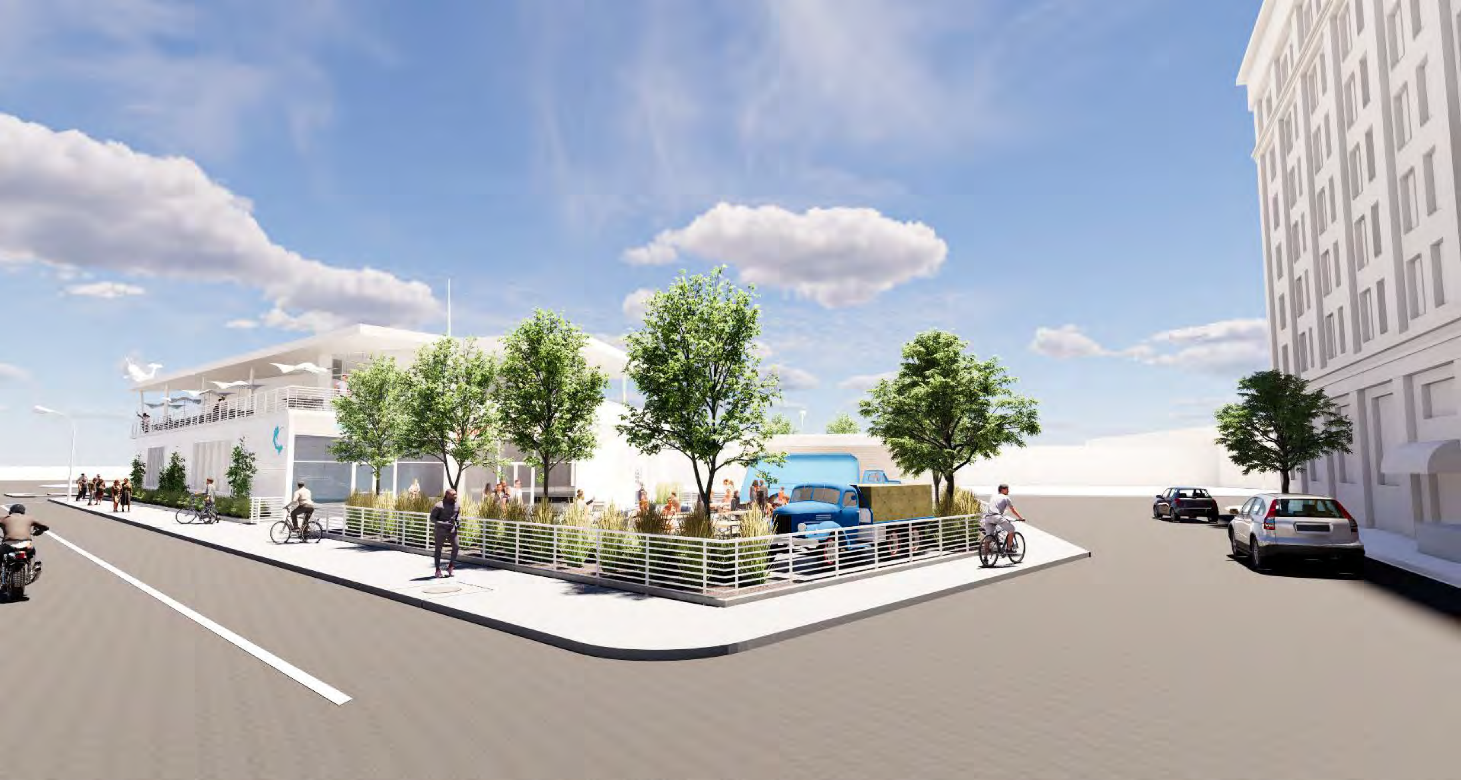
VIEW FROM CHOUTEAU & HEMP LOOKING EAST