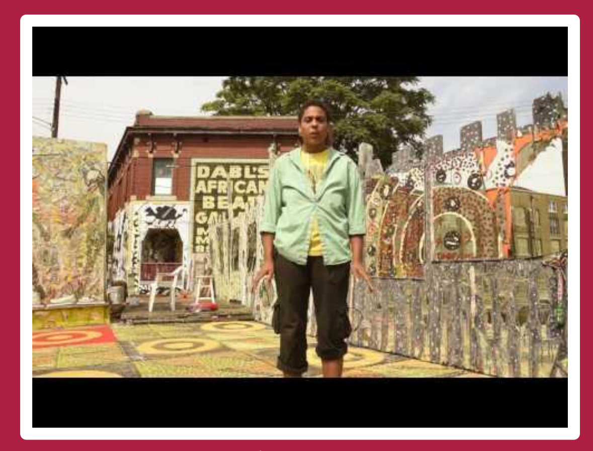
Detroit Case Study

After watching the video, we will ask...What's ONE new thing you learned about community benefit agreement ordinances?